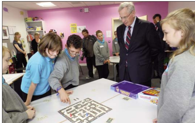
ROYAL VISIT: HRH The Duke of Gloucester looked around Cambourne Village College before unveiling a plaque.