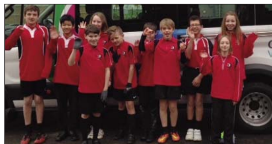
HARDY SOULS: The Cambourne cross-country team.