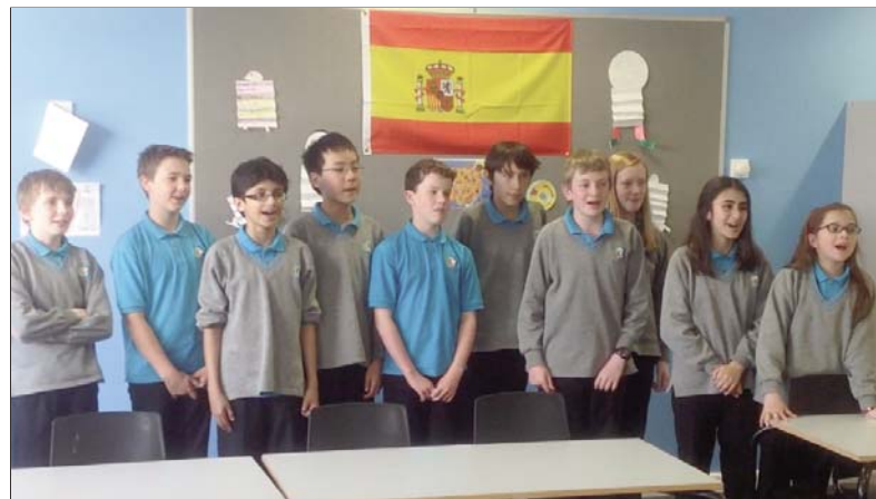
INVENTORS: The pupils who created their own language.