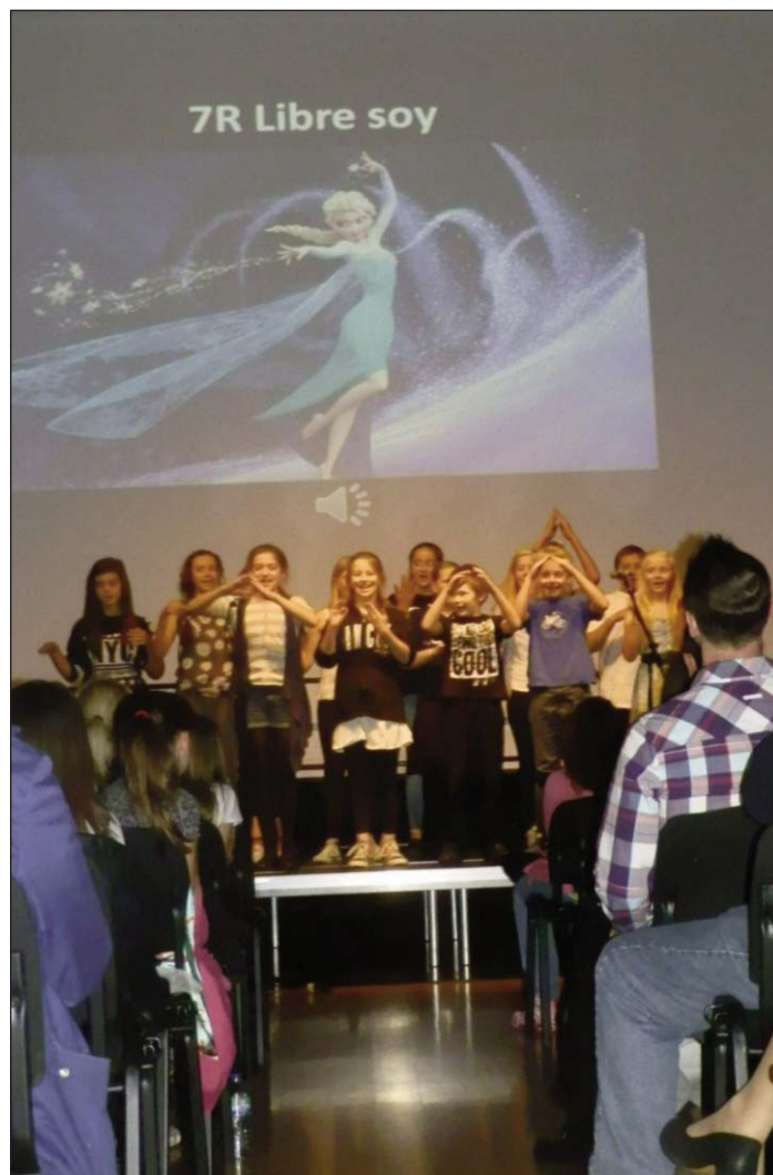
WINNING PERFORMANCE: Members of 7R sing Disney's 'Frozen' at the International Talent Evening.