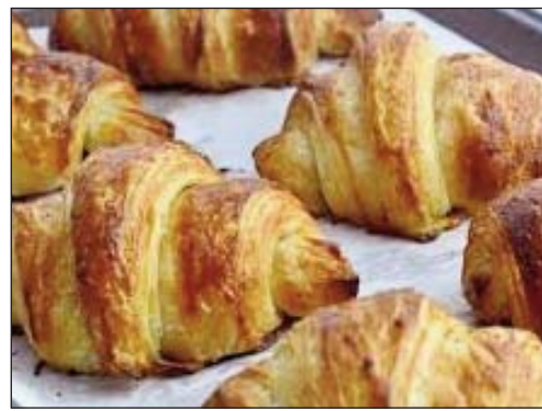
VARIETY OF TREATS: Will be on offer during the new Activities Week trip next summer.