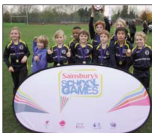
WINNERS: Coton pupils