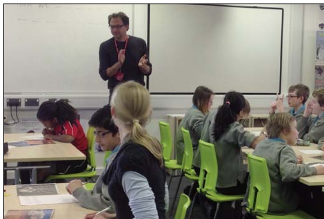
AUTHOR WORKSHOP: Cambourne students with Marcus Sedgwick.