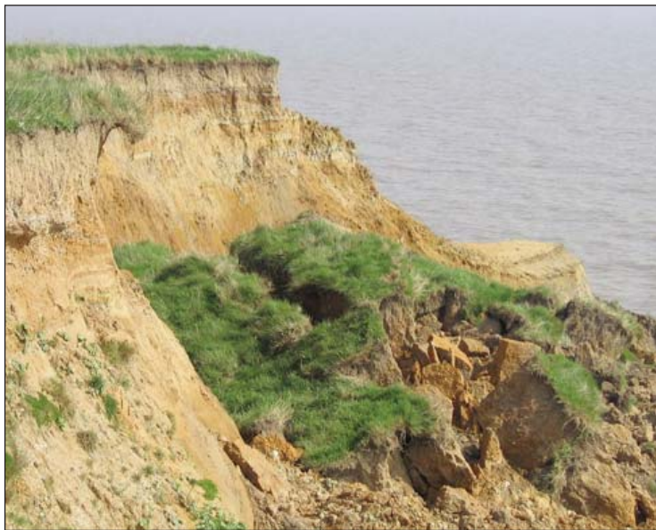
COLLAPSING CLIFFS: One of the erosion issues at Walton-on-the-Naze.