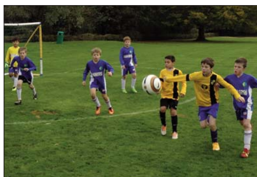
ON THE RUN: Action from Meridian (blue) against Jeavons Wood.

A record number of primary schools from across South Cambridgeshire took part in the district round of the English