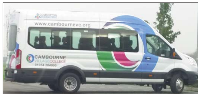
NEW WHEELS: Cambourne's minibus

TEAMWORK IS KEY: Games with meaning for students from all the academies of the Trust.