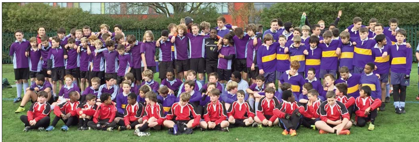
COLOURFUL: The Twickenham, Comberton and Cambourne teams' photo-call and (left) the Cambourne team.