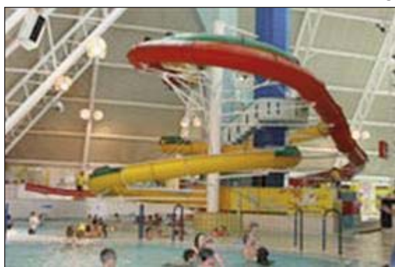
FUN TRIP: To Bedford Oasis.