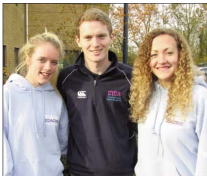
CHOSEN: The Comberton Sixth Formers.

The National Talent Camp is a unique four-day residential, bringing together 350 of the most talented young athletes, coaches and officials from across England. The camp will see 200 coaches, 100 athletes, and 50 officials participate in a multi-sport, multi-role camp, to increase individual aspiration and ambition, and develop empathy.