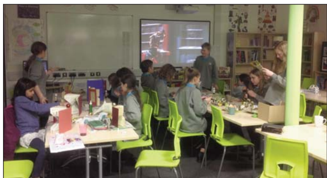
FESTIVE: Library helpers worked on a Christmas display, which included 'book angels'.