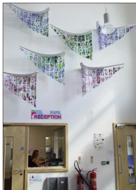
PRIDE OF PLACE: The glass sails hang in the foyer.