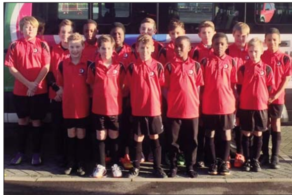
LOOKING FORWARD: Cambourne's boys have more fixtures after February half-term after their cup exit

Their school friendly fixtures start after February half term, which we are all excited about.