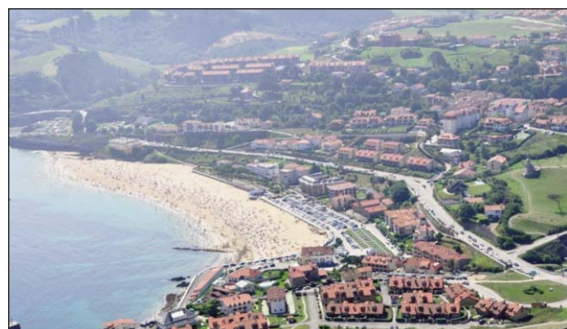
COMILLAS: Destination for the Year 7 trip to Spain