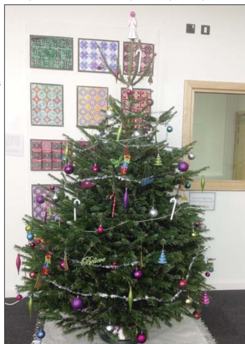
DONATED: Cambourne's Christmas tree.