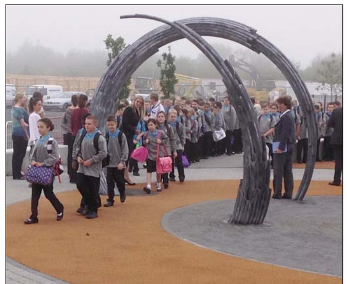
FILING IN: The new Year 7 students pass through the arch on their way in for the first day.

All in all, the whole year group had a great time and it was a fantastic way to end our first term.