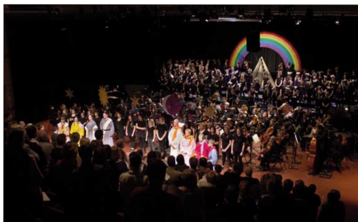
COLLABORATION: An international cast performs Noye's Fludde at Comberton.

Additional Melbourn students were joined by those from Foxton, Harston & Newton and Hauxton primary schools in the chorus with students from Comberton