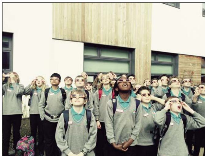
SUN'S OUT: Pupils don their solar viewers but it's too late to see the eclipse.

If students can't wait until 2026 for the next phenomenon in the sky, fingers crossed for a clear night on the night of September 28, when there is a full lunar eclipse!