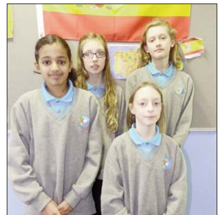
TOP FOUR: Regional final qualifiers.

The regional final takes place at Comberton Village College on April 15 so Cambourne's finalists are in for a busy Easter holidays learning their words.