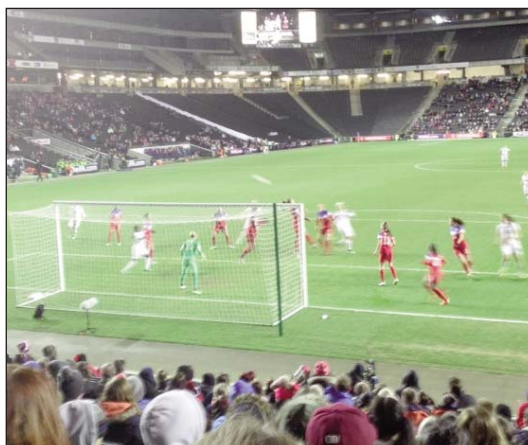
VIEW FROM THE STANDS: Cambourne students were in the crowd at Stadium MK