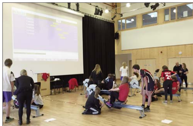
IN FULL SWING: The rowing competition taking place at Cambourne for the second year running.

Students went on to the National Junior Indoor Rowing Championships in London where they competed both individually and as a team and worked hard and showed great tenacity in all their races.