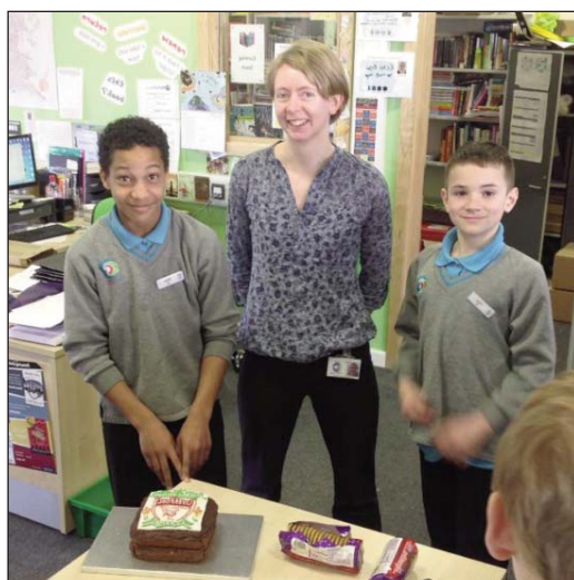
READ WELL AND EAT CAKE: Celebrating exceeding reading targets.