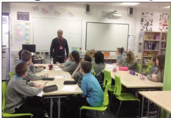
BE CREATIVE: Bali Rai leads a creative writing workshop.

Wednesday was Maths — pupils had to answer a number of questions and then add the answers together to see if they would get the right combination to the padlock on the Treasure Chest. This was the