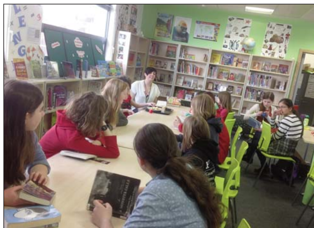
SHADOWS: Students will read and discuss all the titles on the Carnegie shortlist.

We will also spend a couple of sessions looking at the shortlist for the Kate Greenaway Award – which is for illustration within children's books.