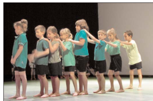
EGYPTIANS: Pupils from Monkfield Park perform at the Dance Share.

A DVD resource has now been produced for all of the schools to use within their