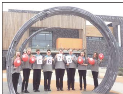
LOOK WHAT WE RAISED: Pupils show off their Comic Relief contribution.