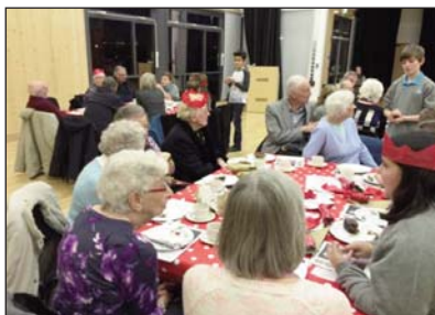
COMING TOGETHER: The older and younger generations.

From a personal level, it is great to see so many volunteer to cook, serve and entertain older members of the community and our students have really benefitted from conversations which they have with our guests.