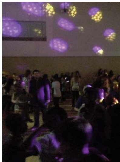
SOUND AND LIGHT: Disco fun.

"I enjoyed spending lots of time with my friends, the music was fantastic there were songs like Uptown Funk and Moves like Jagger. "My friends and I extremely enjoyed celebrating the end of a long term, of hard work. The disco was a great opportunity to hang out with the new friends I have made. "My favourite part was when I saw the teachers dance; it was hilarious!"