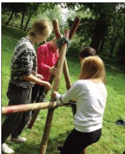
ALL ACTION: Students enjoying the Beaumanor activities.