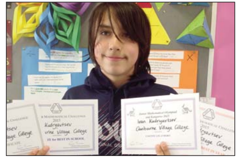
ACED IT: Cambourne's multi-award winner.