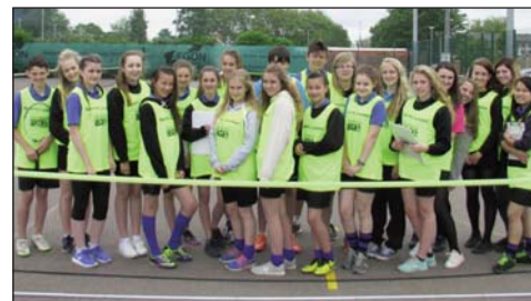
TEAMED UP: The Meridian winners and leaders from Melbourn (left) and Comberton.

Meridian fared equally well in the 'Plate' Competition for schools' B & C teams with their B Team victorious. A week later another 18 teams gathered at Melbourn to see who would join the teams from Meridian and Burrough Green in the Cambridgeshire and Peterborough Sainsbury's School Games Summer Finals where they would represent South Cambs SSP against the very best teams from the four other districts in the county. After sharing the honours in