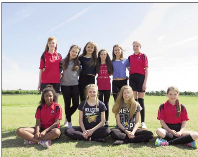
MEET THE TEAMS: Some of the students who have represented Cambourne this year at rowing, netball, football, cross-country, dance and athletics.