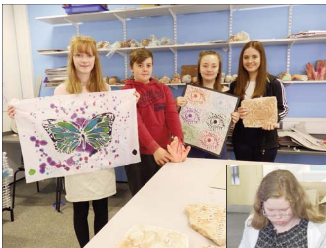
VARIETY: Some of the things going on during Activities Week included art, crafts and meeting reptiles and snakes from the Animal Experience.

Get Crafty students made a range of craft items, often from recycled goods including socks, wrapping paper and ribbons, while Be Active participants played a range of sports, completed a 10-mile hike, went into Cambridge by bus and enjoyed a BBQ. For those opting for Wild Week, there was swimming and climbing in Cambridge and a visit from the Raptor Foundation on offer. At school there was also the chance to take part in Drama Week, Dance Week or Tech Week, while further afield a group of students experienced skiing at Hemel Hempstead snow centre.