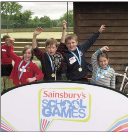
WE DID IT: Haslingfield's winners celebrate their success.

children really enjoyed themselves and loved having a go at all the different sports on offer. There were no prizes for winners on the day as it was all about the children having a go and giving it their personal best and we hope we have inspired some of them to give sport a go and get more involved. "We couldn't do it without the support of the local secondary schools so I must thank the staff and leaders from Impington, Cottenham, Swavesey, Comberton, Melbourn and Linton Village Colleges as well as Cambridge Regional College. "They did an amazing job on the day organising all of the activities and leading the children; offering them encouragement and support as they gave it their best."