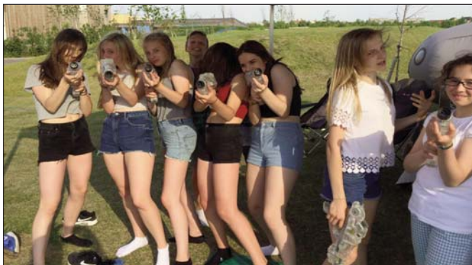
ARMED AND READY: A team prepares to go into the tunnels.

The year group are looking forward to spending more time socialising together in Year 9.