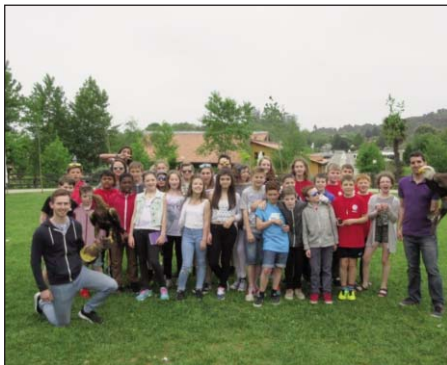
SOMETHING NEW: At a Birds of Prey show (above) and making arrows (right).