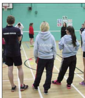
IN TRAINING: Coaching for young coaches.

The Academy is open to any young person aged 15+ who wants to develop as a coach, gain coaching qualifications or training and is actively committed to coaching. Further information and an application form can be found on our website www.scssp.co.uk or ask a member of your PE dept for further information.