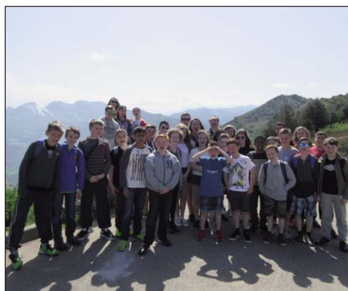
IMAGES OF SPAIN: In the mountains (above) and at Gaudi's house (right).