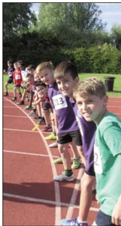
ALL GO: At the Quadkids competition.

The fantastic facilities at Cambridge University Sports Ground on Wilberforce Road played host to the annual South Cambs SSP Year 5/6 Quadkids Athletics Competition with a record 22 teams competing in the event.