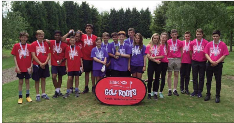
ANYONE FOR GOLF: The teams after the School Games golf finals won by South Cambs.

With 16 medal-winning performances and eight golds, South Cambs SSP were delighted to claim the overall title of School Games Champions for the 2014/15 academic year. The full results can be viewed online at www.scssp.co.uk