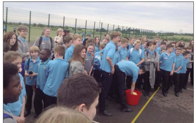
FOOD AND WATER: The targets and throwers at the Sponge the Teacher (above) and the cake sale (below).

Year 8 at Cambourne VC have had a busy half term proving how excellent they are at raising money for charity and having fun along the way.