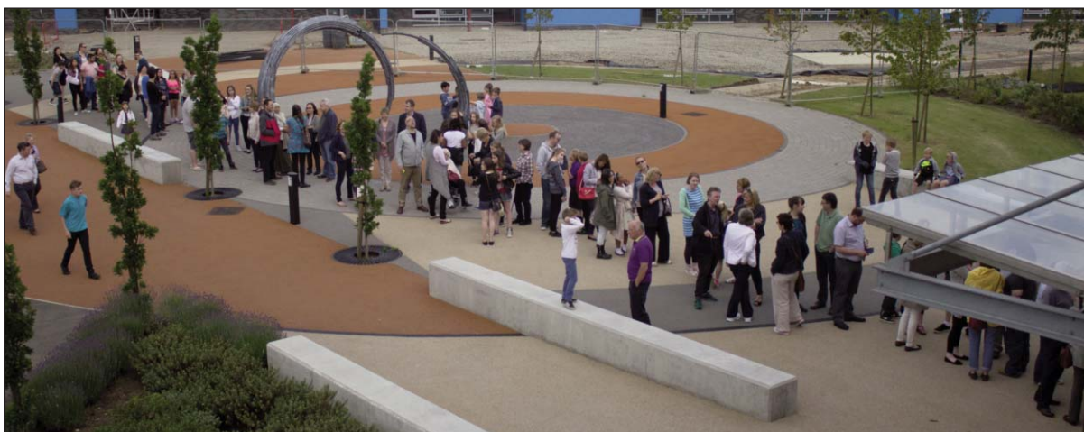
SHOWTIME: Scenes from the Cambourne production of ‘Grease’ and (left) the queue for admission.