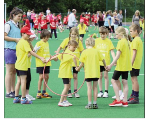
ALL ACTION: Year 4 pupils at the South Cambs Partnership's Mini Olympics.