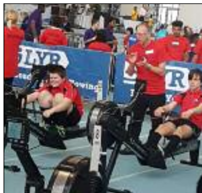
EFFORT: Cambourne rowers give it their best.

Cambourne pupils attended the National Junior Indoor Rowing Championships at Lee Valley Athletics Stadium. Schools and rowing clubs from all over the country, with boys and girls from Years 7-13 competing, attended the event, which was held in the stadium itself so made for a fantastic atmosphere.