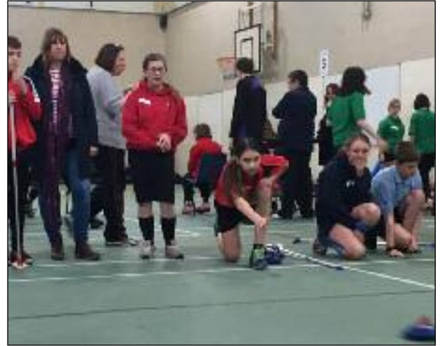
SUPPORTIVE: The Cambourne team played in great spirit in all four sports, including New Age Curling (above).