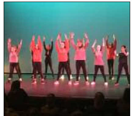
DANCING GIRLS: Cambourne students performed in a show at The Leys School