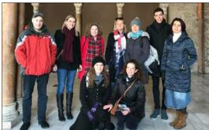
LEARNING VISIT: Teachers spent a week in Zaragoza.