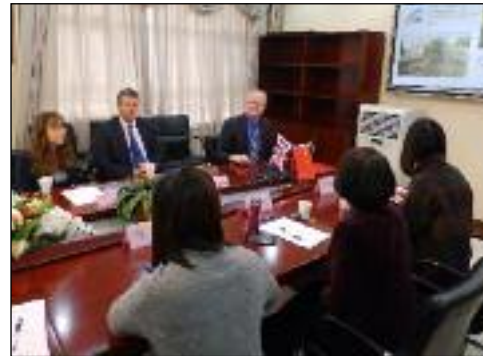
IN DISCUSSION: The Trust delegation meet their opposite numbers in Beijing.