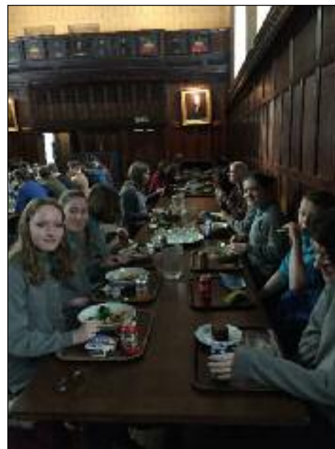
FINE DINING: Students enjoy lunch in the Peterhouse dining hall.