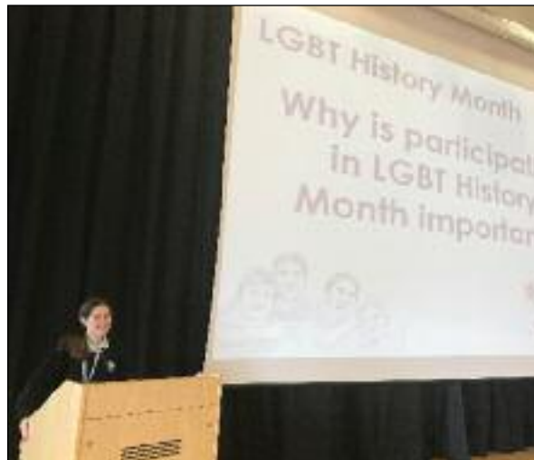
SPEAKING OUT: About LGBT issues.