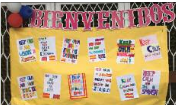
WARM WELCOME: For the exchange students on arrival at the Rosa Molas School.