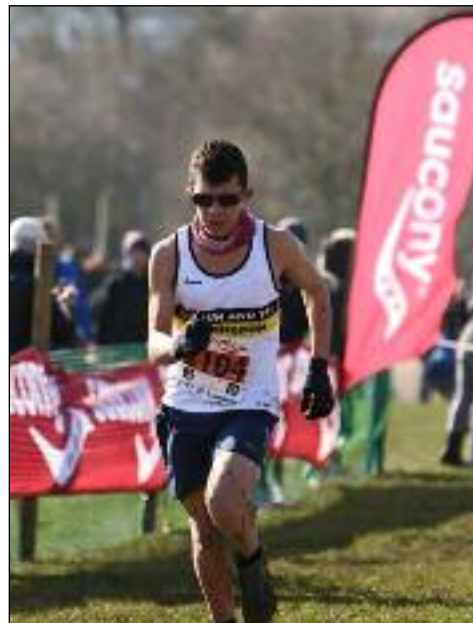
ON THE RUN: At the English Championships.

"It was a lovely evening celebrating school sport and dance and I was incredibly proud of our pupils. They are the first ever CamVC pupils to win medals and awards. Well done to all of them."