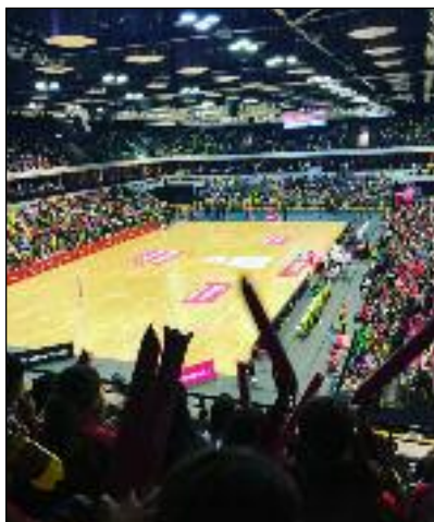
CLEAR VIEW: For the Cambourne girls.