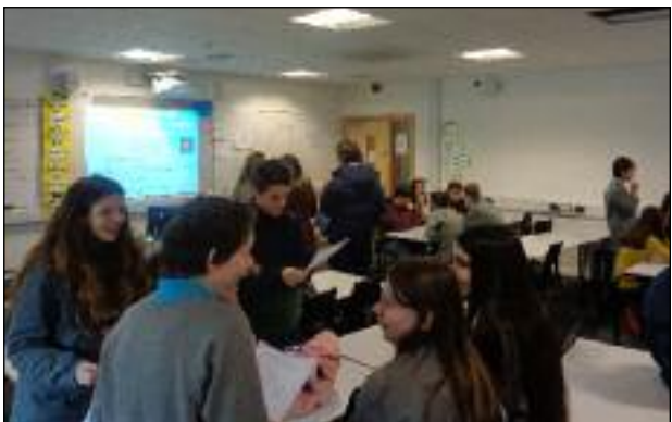
MAKING FRIENDS : On the Spanish Immersion Day.