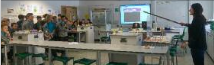
MAGIC WAND: Students watch the experiment from a safe distance.