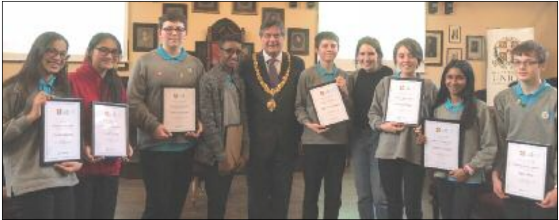
RUNNERS-UP: Cambourne's novice debating team impressed in their first competition.