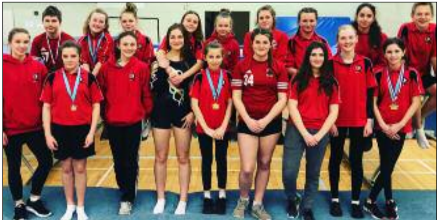
FULL OF BOUNCE: Cambourne's trampolinists competed at Sawston.

To end the day Mariana entered into the KS4 novice category and completed in a fantastic routine, showing real determination, to take bronze. Well done to all the pupils involved.