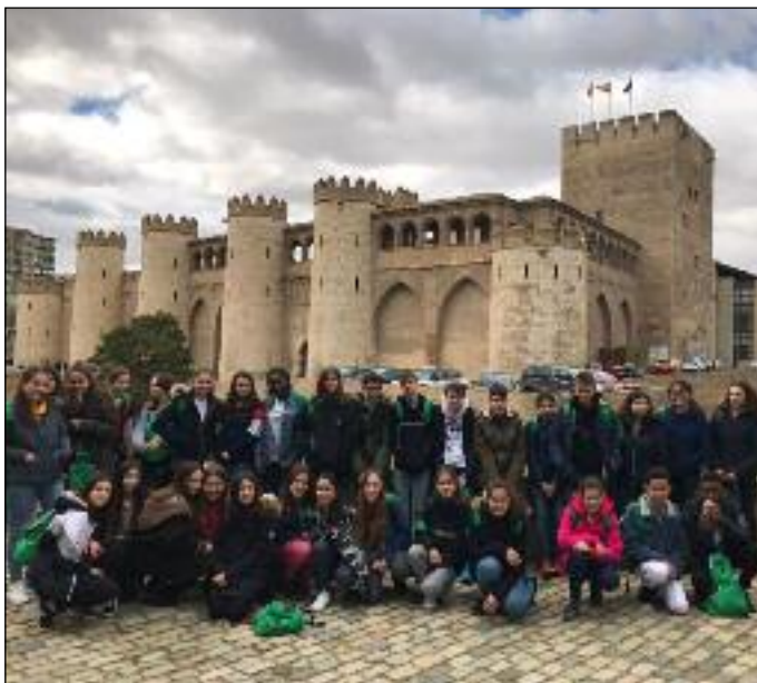
OUT AND ABOUT: Seeing the sights of Zaragoza with our Spanish partners and Comberton students.