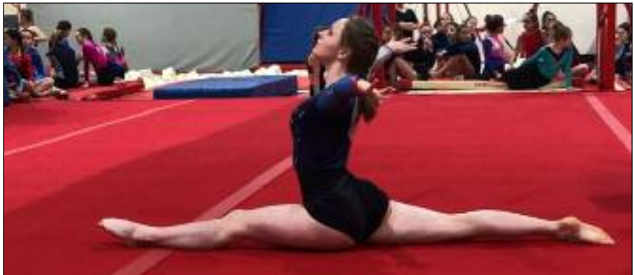
POLISHED PERFORMANCES: From all the Cambourne competitors.