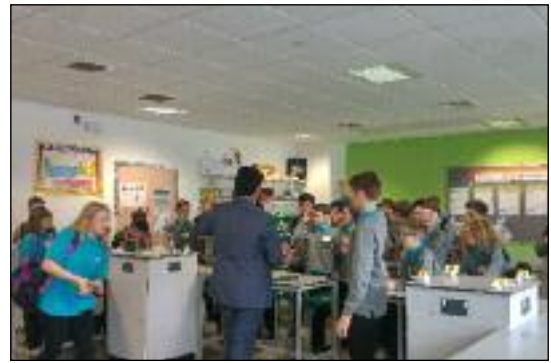
GATHER ROUND: Teachers demonstrate their favourite experiment.

Topics our students covered included: the rise of Formula E, being a teenager in 2018, Papworth Hospital's relocation to Cambridge and Cambourne's 20th birthday.