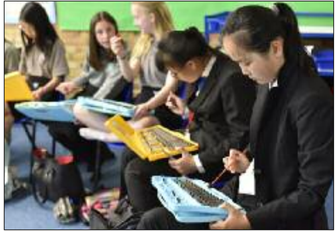
JOINING IN: Students went to lessons with their buddies.