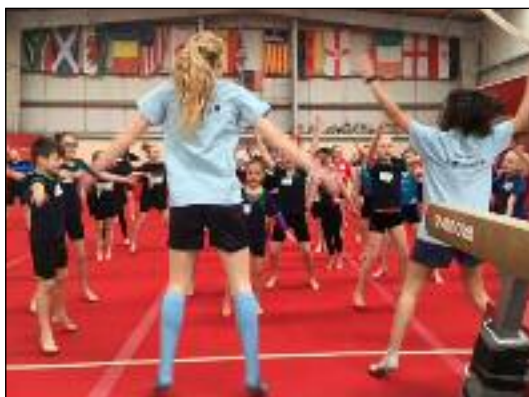
LEADING BY EXAMPLE: Students run the warm-up.