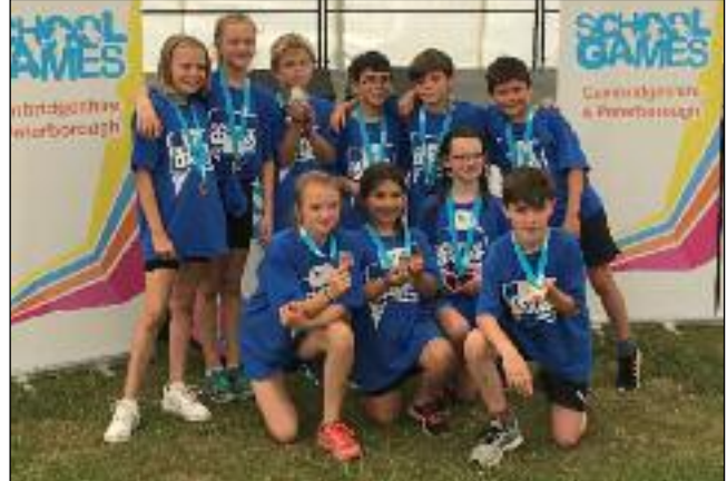
MEDALLISTS: Coton with their bronze medals.