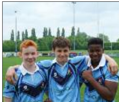
A TOUR TO REMEMBER: For Cambridge's three Comberton players.