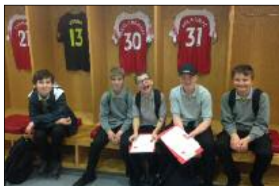
HOME TEAM DRESSING ROOM: Part of the Double Club’s Arsenal Stadium tour.