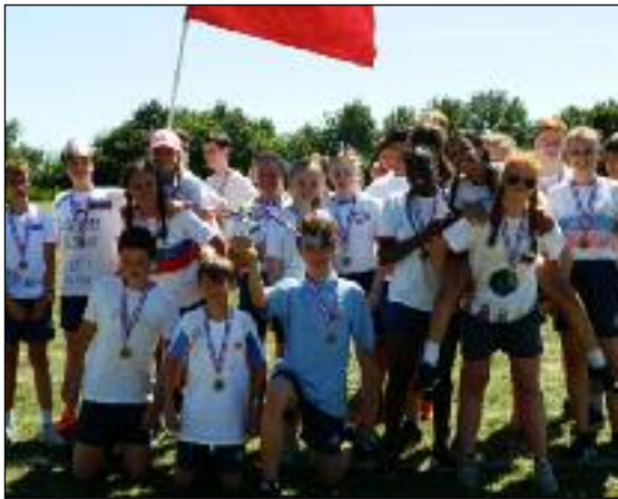
TOP FORM: The Year 9 Sports Day winners.

The overall winners were Hardwick and Cambourne Primary School, but congratulations to all schools who took part!