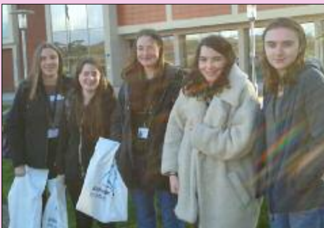
LEARNING DAY: At the Babraham Institute.

Each student was able to select and participate in a lab-based project. The head of the institute presented an overview of the research carried out at the Institute, then PhD students and postdoctoral scientists discussed their career routes into these exciting fields of biological research.