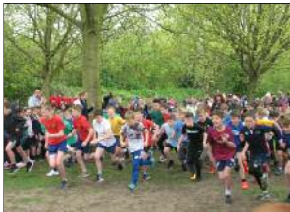
AND THEY'RE OFF: The start of a boys' race.