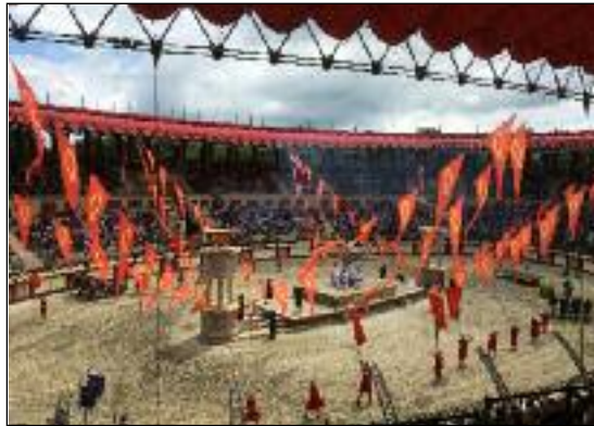
AN AMAZING THEME PARK: At Puy du Fou