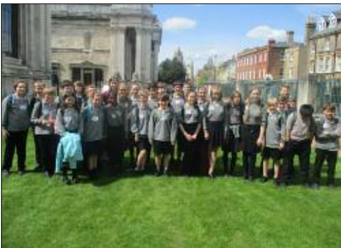
IF THE CAP FITZ: Students help out at the Fitzwilliam Museum.