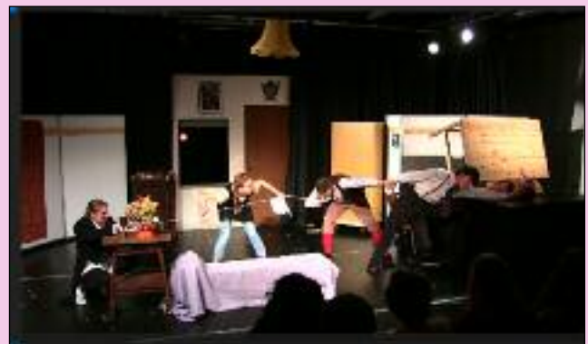
A SERIES OF UNFORTUNATE EVENTS: Nothing goes right in The Play That Goes Wrong .