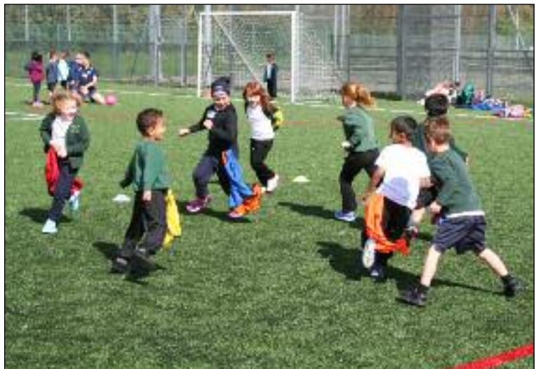
PLAYING AND LEARNING: Pupils at the multiskills event.

All pupils received certificates for their participation in the day and showed excellent enthusiasm for the activities. Congratulations to all involved in the festival and thank you to the sun for shining down on us all morning!