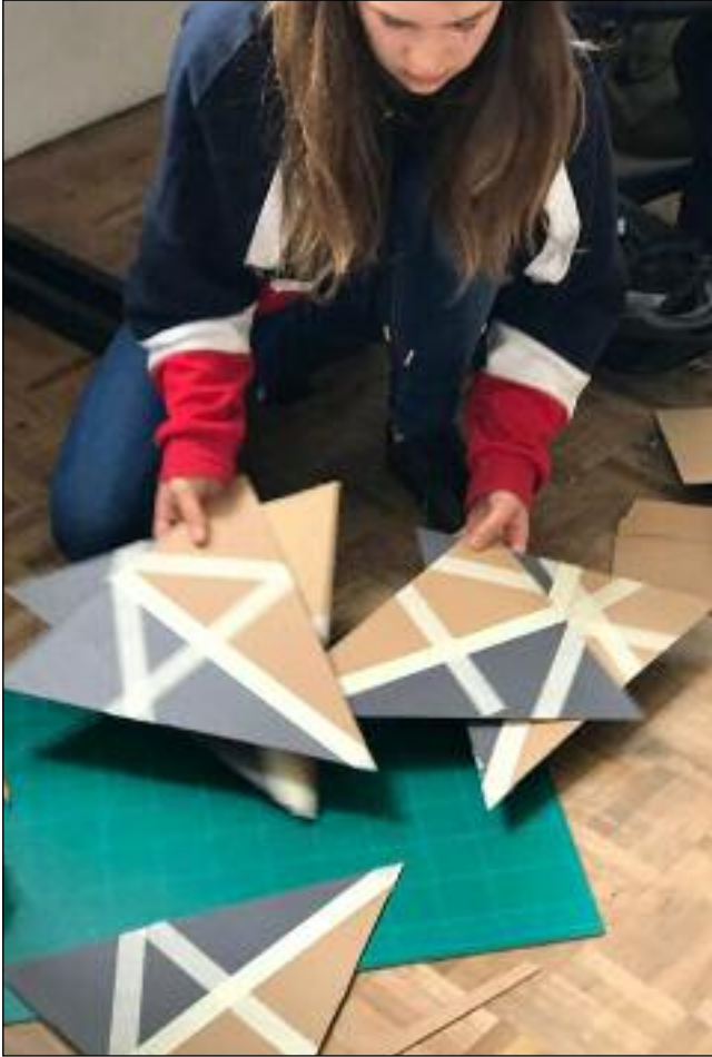
GETTING ARTY: At the Saturday Club (above) and at the Somerset House exhibition (below).