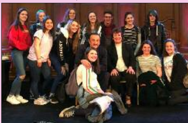
PHOTOCALL: Students with Philip Zimbardo.