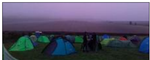
TOUGH GOING: DofE practice in inclement weather.