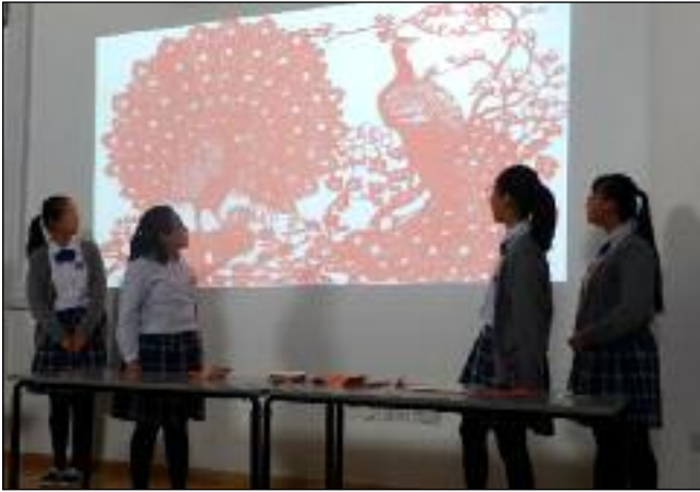
CENTRE STAGE: Presenting to Year 7.