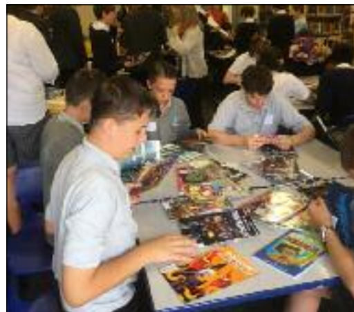
WHAT'S ON OFFER: Comberton students look at graphic and manga reading material.

It was a fun day for all — Thank you Kimbolton!