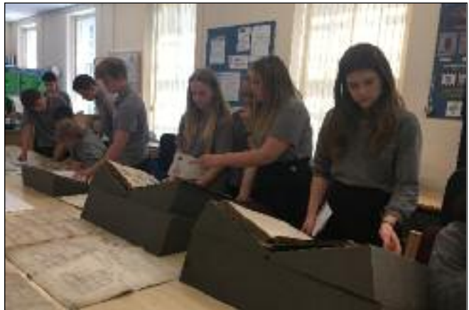
CAMBRIDGE HISTORY: Students learn about their home city through the ages.