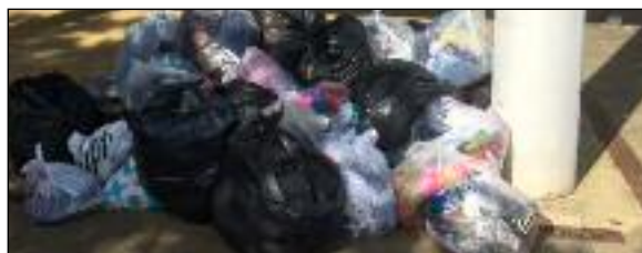
BAGGED UP: The clothes waiting to be collected.

We have run another very successful Bags 2 Schools fundraiser, which took place last month. Many thanks to all the pupils and parents who donated bags of clothes and shoes, and also to the prefects who helped. We are waiting to find out how much we raised, and this money will then be spent on various pieces of outside equipment around the school.