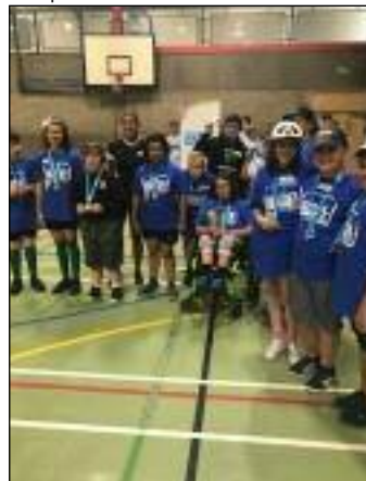
ADAPTING WELL: Members of the South Cambs team.