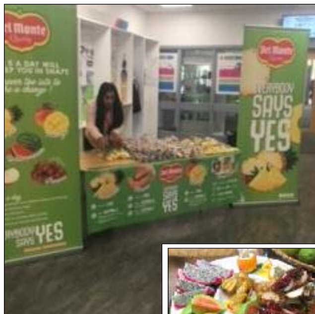
FEELING FRUITY: A visit from Del Monte and a platter from the catering team.

Teenage sugar consumption is three times the recommended limit, with sugary drinks being their main source of added sugar. Please do try to make a change —