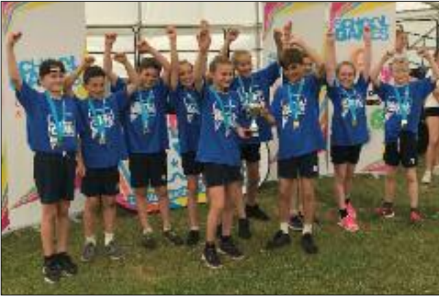
WE ARE THE CHAMPIONS: Harston and Newton celebrate.