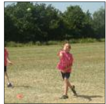
FESTIVAL FUN: Year 6 pupils contested a series of athletic events.