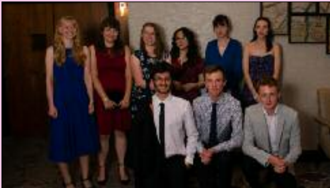
PARTY NIGHT: For Year 13 leavers at the Hilton Hotel.