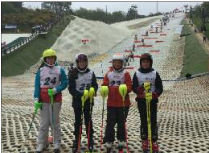
BATTLING THROUGH: Comberton's team on a miserable day at the Eastern Region School Race.