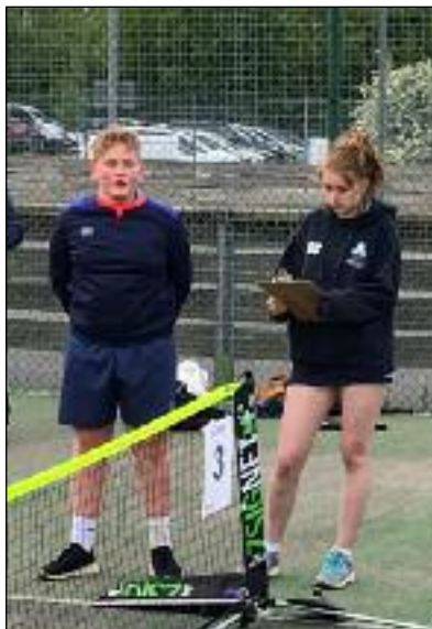
CONCENTRATION: Comberton's sports leaders.