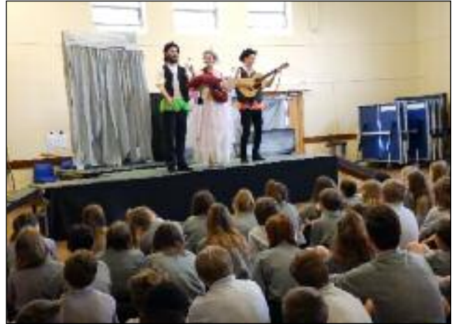
WATCHING BRIEF: Year 7 focus on the actors.

thoughtless treatment of Helena to belly laughs at Bottom's ever-expanding ego! The English Department and our colleagues who attended weren't at all surprised that this Shakespearean performance so captured the imagination of our students who were enthralled as an audience by this production.