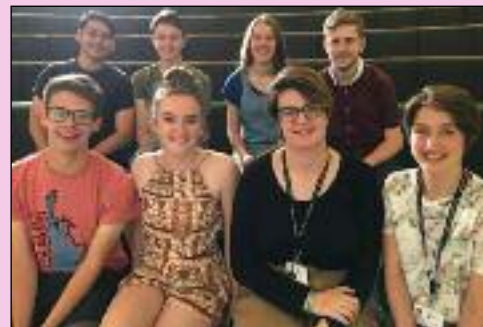
NEW TEAM: Members of the Sixth Form Council.