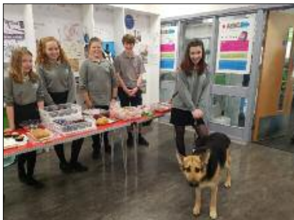
HELPING PAW: Working dog Hero stole the show at the Year 8 cake sale in aid of Guide Dogs UK.