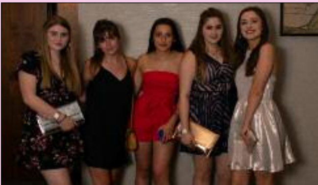
ALL DRESSED UP: Sixth formers arrive at their Leavers' Dinner.