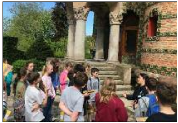
CULTURAL TOUR: Of Gaudi's house, El Capricho.

"Food was incredible. We tasted things like chocolate con churros, Colacao and tapas. They were all