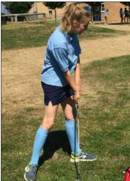
STREET GOLF: New for Year 9.