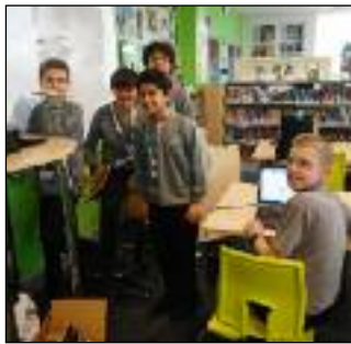
WORKING NEWSROOM: The heart of the action at CVC.