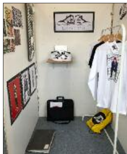
IN STORE: Sam Pinches' work on show.