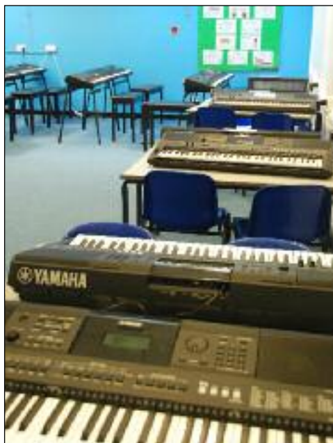
MAKING MUSIC: With new keyboards.

There were students carrying each other, pupils in a wheel barrows, three-legged pairs as well as students on space hoppers all adding to the atmosphere of the event.