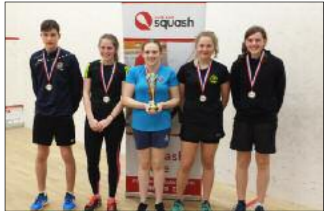
NATIONAL CHAMPIONS: The Comberton squash team.