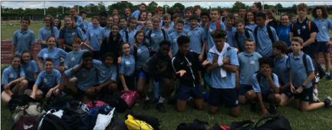
UP FOR THE CUP: Comberton's Olympic Cup winners.