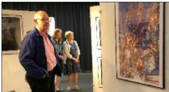
PRIVATE VIEW: For family and friends.

On June the 19th, Comberton hosted the Private View of all GCSE and A Level art and photography. Pupils came with family and friends to celebrate and view a huge range of art work from across both qualifications.