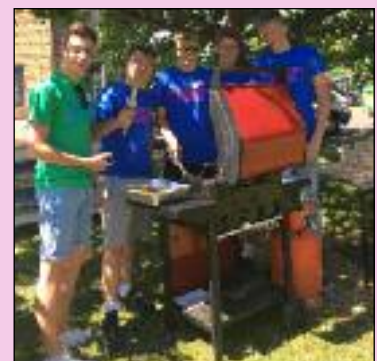
WELCOME EVENT: For prospective Year 12 students included a barbecue.