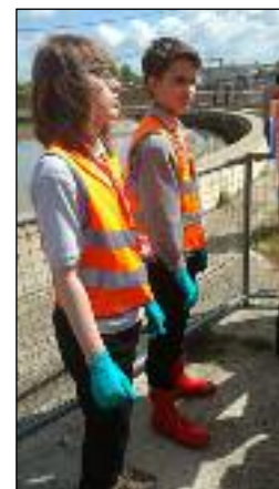
ON TOUR: At the water recycling centre.