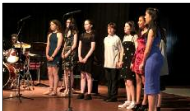
AN EVENING OF CELEBRATION: At the CASA awards.