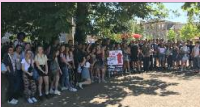
ON TOUR: Comberton's Sixth Formers visit Leicester University.

With the further opportunity for every student to attend individual guidance meetings and specialist sessions to support the planning of personal statements during Futures Week, we are confident that our students will already feel well placed to start looking ahead to life after Sixth Form.