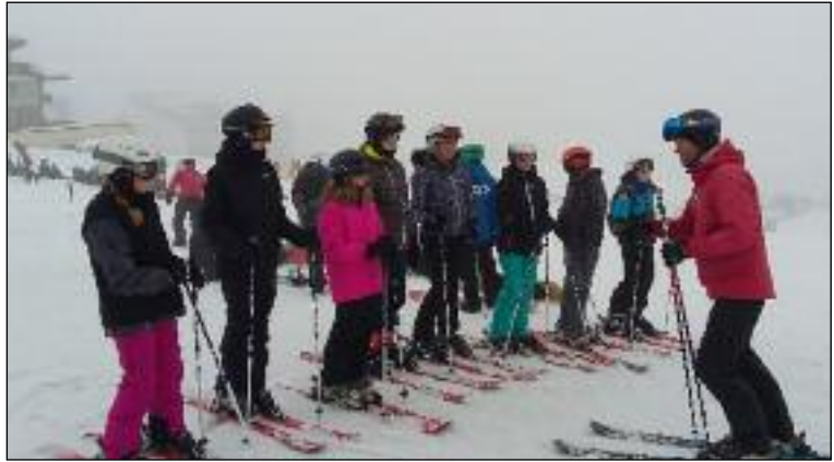
UNDER INSTRUCTION: Students having lessons on the slopes in Italy.

The high level of demand this year meant that a huge trip of 75 students from Years 9, 10 and 11, along with nine staff departed for the Aosta valley in the first week of the Christmas holidays. There were so many of us that two hotels were needed to fit everyone in! We were very lucky with the early season snow providing plenty of power, although anyone forgetting their ski jacket on the walk to the Christmas markets certainly felt the cold, with temperatures reaching as low as minus 20 out on the hill. This left room for 35 Year 8 students to travel on the Easter trip. Warmer temperatures were in store, but, almost unheard of so late in the season, we were treated to heavy snow throughout this week as well. A few of the students (and staff) would have liked to stay for another week! Planning for 2018-19 trips is in full swing, with information on how to sign up already with parents.