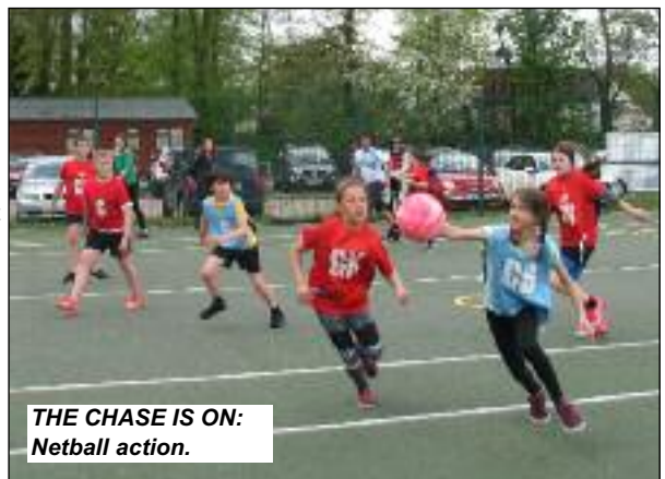
THE CHASE IS ON: Netball action.