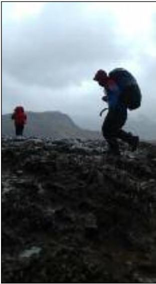
PLENTY OF CHALLENGES: For participants on the DofE gold practice expedition in the Lake District.

We now await the assessed expedition later this month where the prospect of better weather and less rain looms...although is never a guarantee! One thing that we can be certain of is that this group of Gold students are ready to tackle anything that the Snowdonia mountains can throw at them!