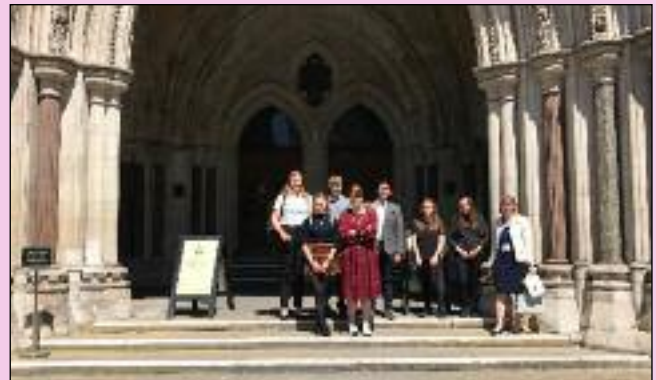
ROYAL VISIT: Students at the Royal Courts of Justice.