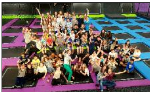
ON THE BOUNCE: Year 8 at Xtreme 360.