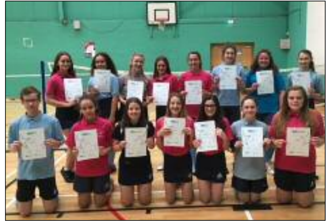
SUCCESS: A Year 10 class with their YST certificates.

Pupils were required to log a minimum number of hours of physical activity and to take part in leadership training and volunteering. They also set targets to improve