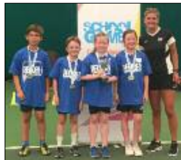
DOUBLE WINNERS: From Harston and Newton.

The finals were played in a round robin format with each team playing the other three in timed singles matches. As expected the matches were extremely competitive with a great standard of tennis on