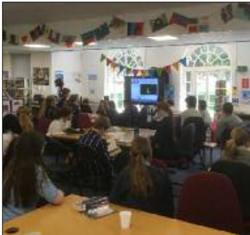
THE BIG REVEAL: Students wait for the Carnegie results.