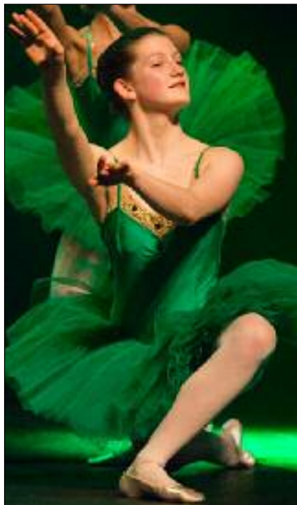
ADVANCED TRAINING: For one of Comberton's talented dancers.