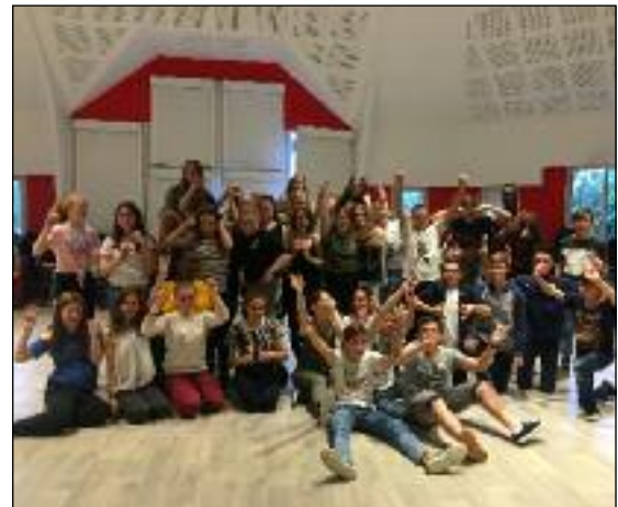
FRIENDS TOGETHER: Exchange students.

were very welcoming. For me the highlights were the family meals which lasted around an hour and a half and during which I got to speak with the family lots; the family party at the weekend where I met all the cousins, aunts, uncles and grandparents; and the leaving party because everyone really enjoyed the dancing and food together.”