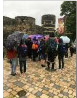
CASTLE VISIT: In the rain!

and kind and I thoroughly enjoyed going to the organised trips such as Puy du Fou and visiting the historic Tapestry in the local Chateau, which I found very interesting.