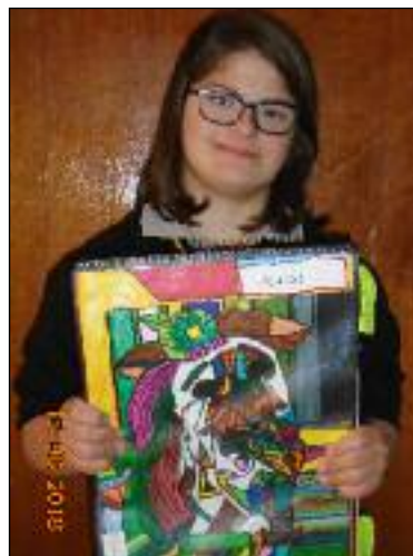
INSPIRED: By the work required to achieve the Bronze Arts Award.