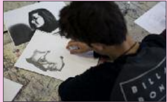
A PRETTY PICTURE: Top ratings for CSF.

"This remarkable accolade shows very clearly that they can do this at Comberton Sixth Form. Very many congratulations to the students and the staff who have managed this. It just shows what extremely high standards now exist in our Sixth Form."