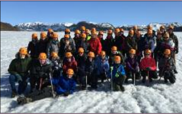
GLACIER WALK: For the Comberton group.

The 2018 Trip to Iceland was a truly unforgettable experience.