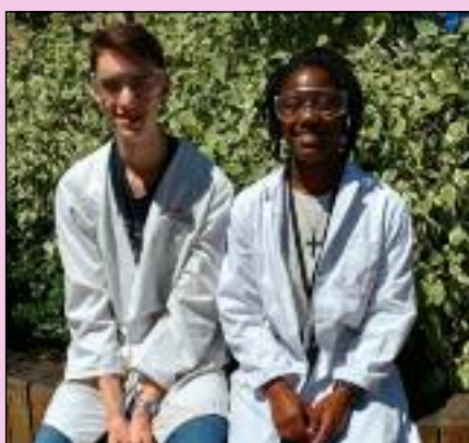
TWO OUT OF THREE: of the Comberton chemists who took part in the RSC competition.

Thank you to Hills Road for organising the event and to the Institute of Physics for providing financial support to enable us to build our robot.