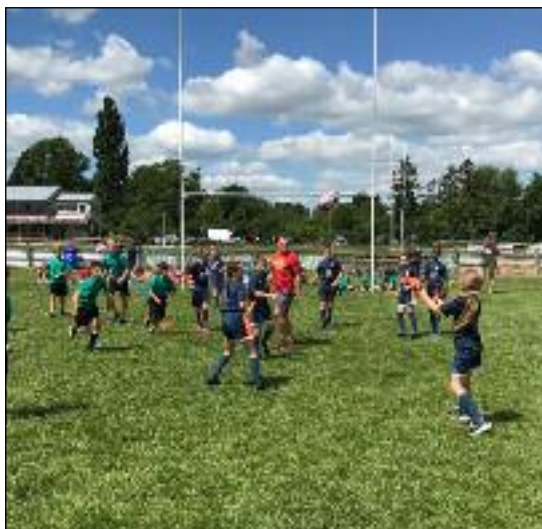
BALL-WATCHING: Action from the tag rugby event.

Year 9 sports leaders from Melbourn Village College played a key role as hundreds of primary school children enjoyed a day of tag rugby matches and activities.