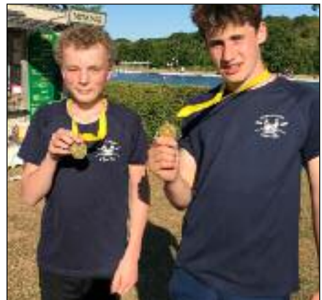
MEDALLISTS: CVC's Cantabrigian oarsmen.