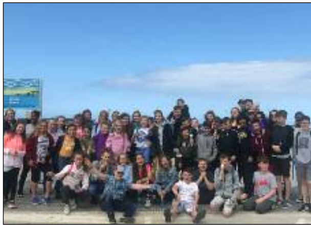
SPANISH SUNSHINE: Year 7 enjoy ice cream at the beach.

"These lessons also helped us to be prepared for meeting some children from Santander. We all felt it was daunting at the