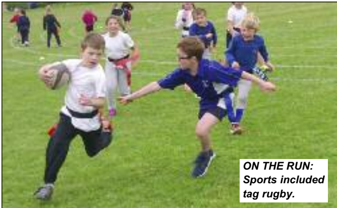
ON THE RUN: Sports included tag rugby.

This May, Comberton hosted the annual Year 3 and 4 Invasion Games Festival for its local primary schools.