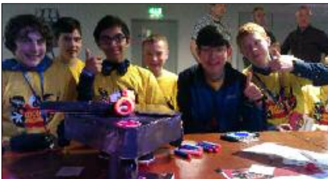
COOLEST PROJECT: Comberton students with their robot.