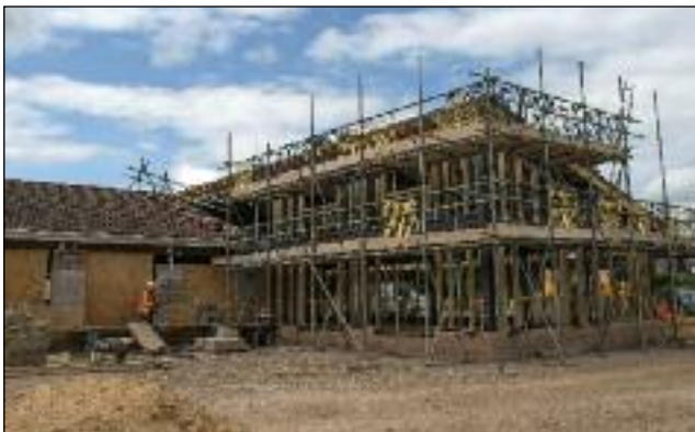
UNDER CONSTRUCTION: Work is progressing on Gamlingay Village Primary.

After much hard work, commitment and determination, the new structure of schooling in Gamlingay is set to start fully in the coming year. Gamlingay First School is to be officially named as 'Gamlingay Village Primary' school. Building work has been going on apace on the Village College site (which has been vacated). This is set to result in a great new Primary School facility fit for the great school that we are all determined Gamlingay Village Primary will be. The remainder of the former Village College (Gamlingay Middle School) will close this summer and thus Gamlingay will fully become part of the Cambridgeshire two-tier system of schooling. Gamlingay Village Primary School has already been confirmed as a feeder primary school in Comberton Village College's catchment area.