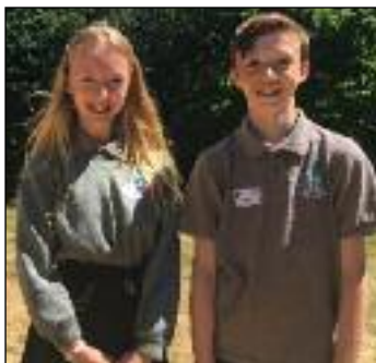
NATIONAL FINALS: For CVC duo.

Huge congratulations to all students involved, it really is amazing to see the way you have played your part in the competition!